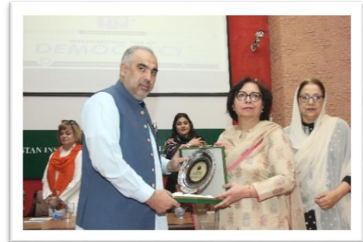
WPC presenting souvenir

Honourable Secretary Women Parliamentary Caucus, Ms. Munaza Hassan welcomed and thanked the panelists and guests for their presence. Ms. Hassan, while talking about the event said that the purpose of the event was to bring the youngsters close to the parliament and to involve them within the political process. Honourable Munazza Hassan, who spoke on importance of youth in promotion of democracy and encouraged the students to take ownership of their state and work for its betterment. She also concentrated on the need for Pakistani Youth to look at Quaid-e-Azam Mohammad Ali Jinnah's struggle and take inspiration from him.